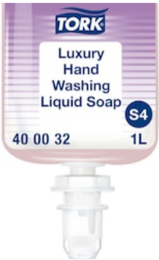
PINK LUXURY SOAP 6/1L 400032