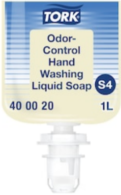
TORK ODOR CONTROL SOAP 6/1L 400020