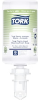
CLARITY HAND WASHING FOAM SOAP 6/1L 401800