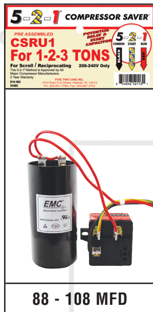
CSRU1 For 1-2-3 Tons For Scroll/Reciprocating