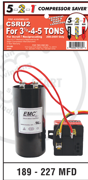
CSRU2 For 3 1/2-4-5 Tons For Scroll/Reciprocating