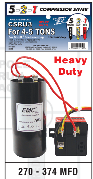
CSRU3 For 4-5 Tons For Scroll/Reciprocating

The 5-2-1® Compressor Saver® has been pre-wired for your convenience. There are only 3 color coded wires which need to be connected. The Black wire will be connected to the Common side of the compressor. The Striped wire will be connected to the Start winding of the compressor and the Red wire will be connected to the Run winding of the compressor. Remember-5,2,1,=Common, Start, Run.