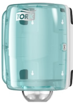
Tork Centrefeed Dispenser 659020