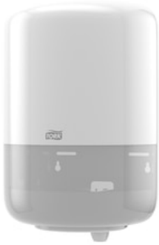
DISP M2 ELEV M BOX PRO WHT 1/CS 559020A