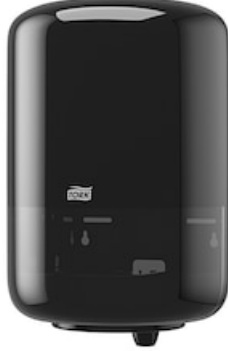
DISP M2 ELEV M BOX PRO BLK 1/CS 559028A