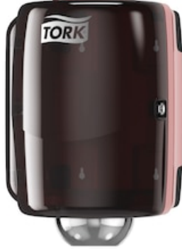
Tork Centrefeed Dispenser Red/Smoke 659028