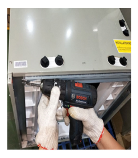
STEP 4 - Align the back of the shield to the same height as the side channels and drill a 1/8" pilot hole through the side channel opening of the heat shield. Install one screw per side.

STEP 2 - Remove the four 1/4" screws from the front channel. Retain the screws and discard the channel.