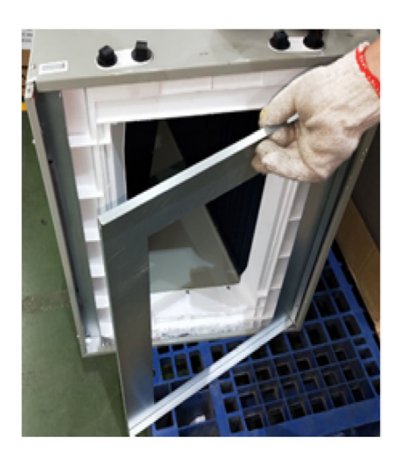
STEP 5 - Reinstall the lower front panel using the screws removed in Step 1.