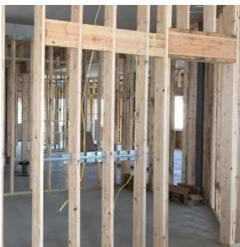
New Construction Header Example