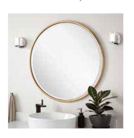
SIGNATURE HARDWARE See website for warranty information

Features: Framed Material: Iron Design: Classic Mirror Shape: Round Width: 36" Height: 36" Depth: 7/8" Mounting Hardware Included: Yes Assembly Required: No Mirror Only Width: 34-1/8"