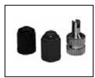
Air Valve Caps