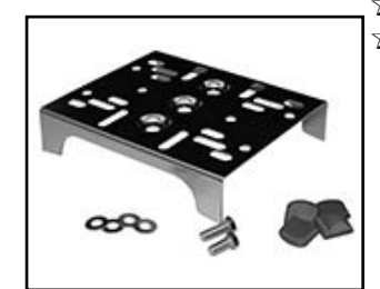
Steel Pump Mounting Bracket Package