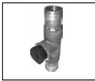
Bleeder Orifice Tee