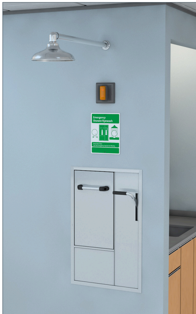
Note: Shown with optional AP280-235 electric light and alarm horn unit (sold separately).