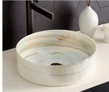
Shown in Abalone