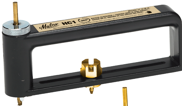
HC1 2-12 in. (51-305 mm) Diameter Circles

Work. Perform. Outlast. Limited Lifetime Warranty