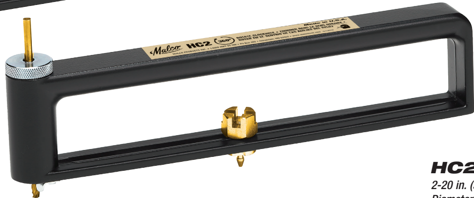
HC2 2-20 in. (51-508 mm) Diameter Circles