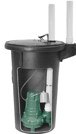
912-0056 (Top Discharge)