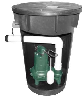
912-0082 (Side Discharge)