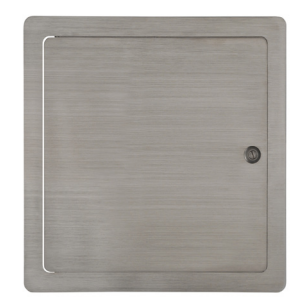
16 Ga #304 Stainless Steel