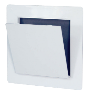
White Plastic Snap-In