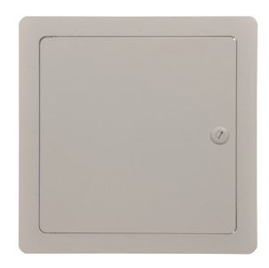
16 Ga Mild Steel White Prime Coated