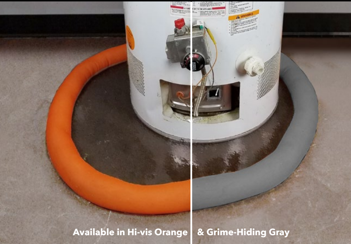
Available in Hi-vis Orange & Grime-Hiding Gray