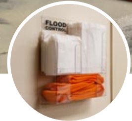
Wall Mounted Rack for Quick Dispensing