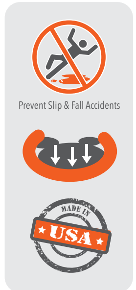
Prevent Slip & Fall Accidents