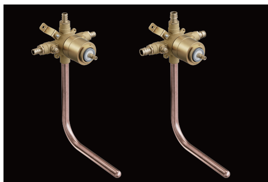
PF4001PTD / PF4001WPTD