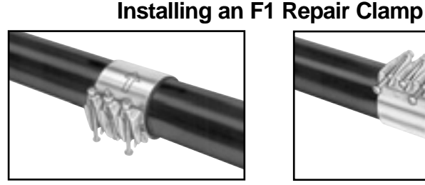
Hook the middle bolt into the receiver lug and tighten the nut until the bolt is secure.

1. Repair clamps are not designed for pipe restraint. Make sure proper restraint is applied when required. 2. ALWAYS RECHECK TORQUE AND PRESSURE TEST FOR LEAKS BEFORE BACKFILLING. 3. Backfill and compact carefully around the clamp according to the pipe manufacturer's instructions.