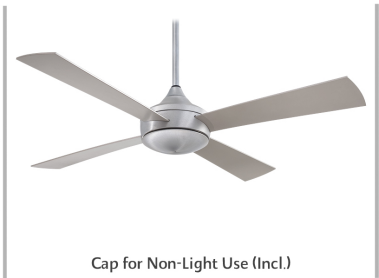
Cap for Non-Light Use (Incl.)