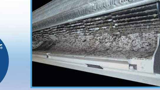
Mold thrives on mini-split blower wheels