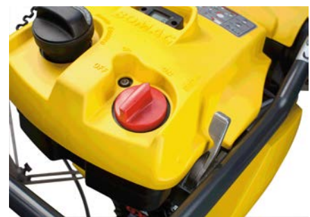
Simple operation Engine and fuel supply with combined switch