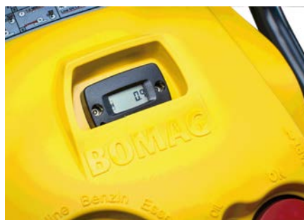
More transparency Hour counter/tachometer with a service indicator which can be reset