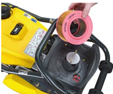
Maximum reliability and longevity All around engine protection