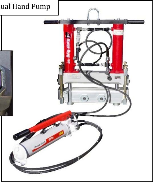
Squeeze Tool w/ Manual Hand Pump