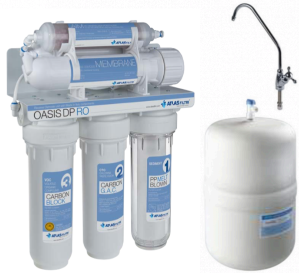
Part Number: RE6075310

Atlas Filtri® is driven to providing our customer with the best available products to meet specific filtration requirements. This is done by using the most advanced manufacturing and design methods. The international patents received come from a constant commitment to research and develop that result in new and innovative products.