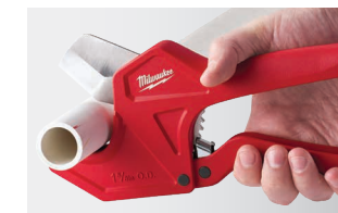
Comfortable Handle Design