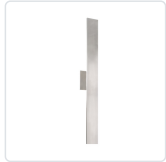
AT7935-BN Brushed Nickel