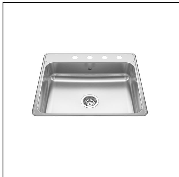
Creemore Topmount/Drop In