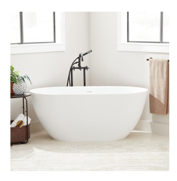
ASSE 1016 Type P/T