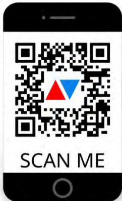
Installed WITH SCALE RX