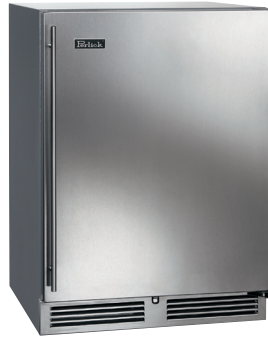
Outdoor Solid Door Model