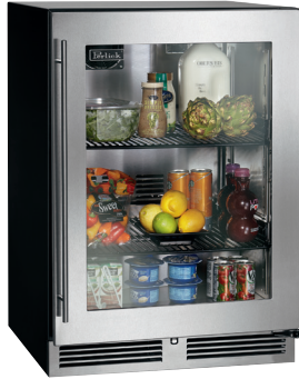
Indoor Glass Door Model

Perlick ® QUALITY & INNOVATION THAT INSPIRES