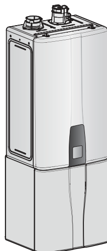
Navien NPE-2 Tankless Water Heater