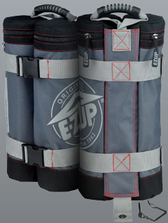
Deluxe Weight Bags