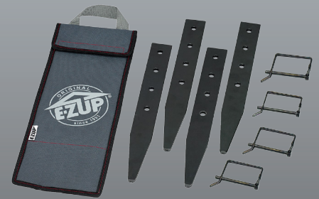
Heavy-Duty Stake Kit

International E-Z UP, Inc. 1900 Second Street Norco, California 92860 (951) 279-0999 • FAX (800) 810-8775