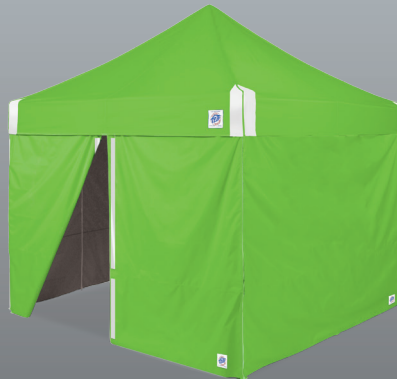
Matching Hi-Viz® Sidewalls