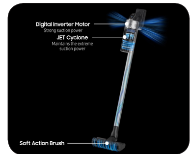
More Advanced Cleaning Performance (200 Air Watts)