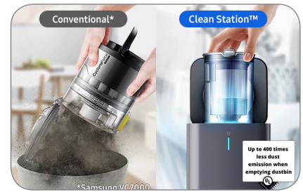
Anti-Dust Emitting Structure