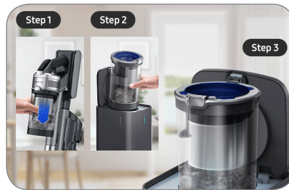
Auto Empty Dust Bin