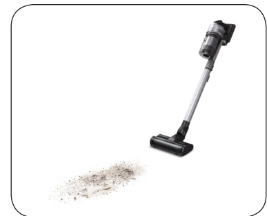
More Advanced Cleaning Performance (200 Air Watts)