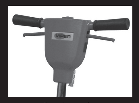
Easy-to-use, fingertip controls.