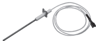
760-401 Flame Sensor

Flame Sensors can be Mounted Remotely on Multiple Burners.