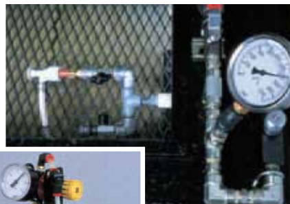
Daily hydrostatic testing (shows 1400psi-actual pressure).

The focus of our production team is to provide the highest quality control that affords ACCOR Technology to offer its unique 10-year labor and material warranty.