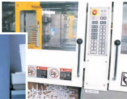
State of the art injection molding.