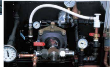
Intermittent shock testing (125psi - 180psi, 140°F, 30,000+ cycles).