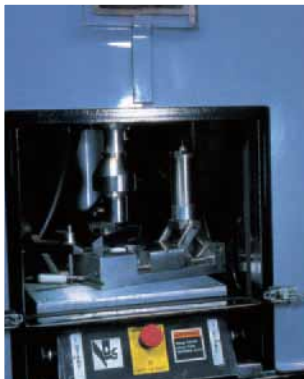
Computerized welding monitors each valve.