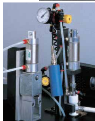
Production air testing with ultrasonic leak detectors.