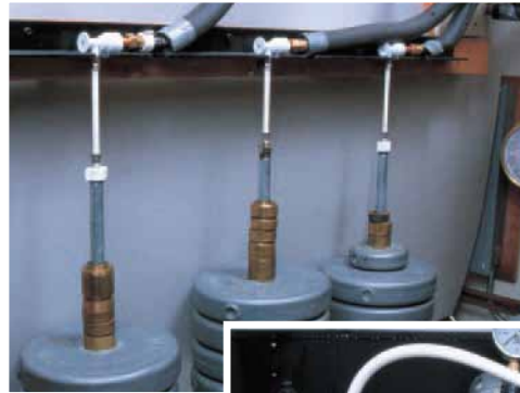
Hot water pull (180°F under direct load).

The design criteria for all ACCOR®s products have a high margin of safety well beyond the standards, backed with the strongest warranty in the business. ACCOR has been manufacturing its patented PUSHON ® technology in its Wenatchee, WA plant since 1988.