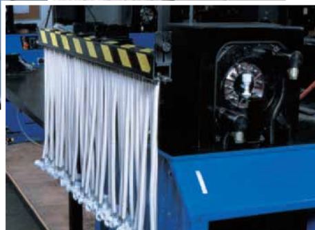
Hydraulic crimping machines.