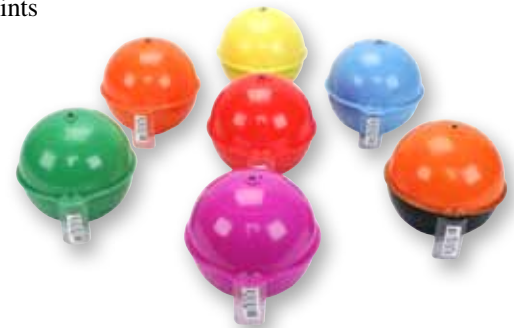
3M™ Electronic Marker System (EMS) XR/iD Ball Markers

Second Generation iD Markers with 4X Memory launching 1Q 2012