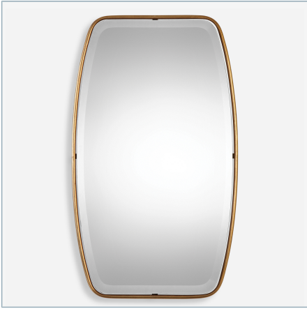
CANILLO MIRROR, GOLD