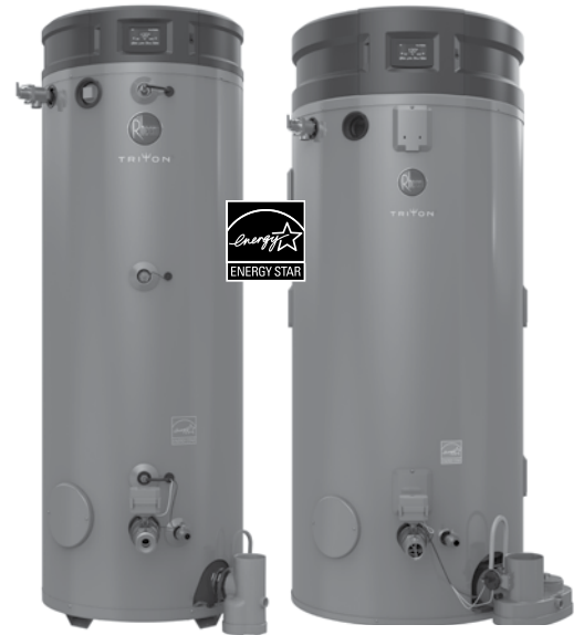
Triton SS 80 & 100-Gallon