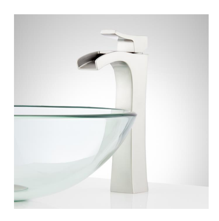
ASME A112.18.1/CSA B125.1 NSF/ANSI/CAN 61-9:Q≤1