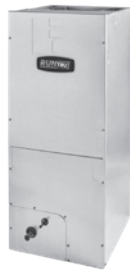
A4AH5 Multi-position Air Handlers