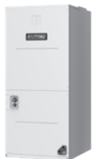
E4AH5 Upflow/Horizontal Air Handlers

Notes: Filter not supplied, remote filter required. E4AH models compatible ONLY with E4HL side discharge outdoor. Copper tube, aluminum fin design Electric heat kit available, reference installer's guide