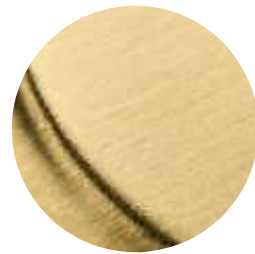
Lifetime (PVD) Satin Brass - 044