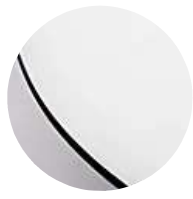
Polished Chrome - 260