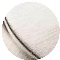
Satin Nickel - 150, US15