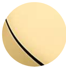
Non-lacquered Brass - 031