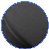
Satin Black - 190