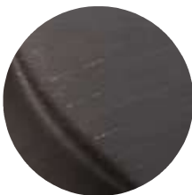
Venetian Bronze - 112, 11P