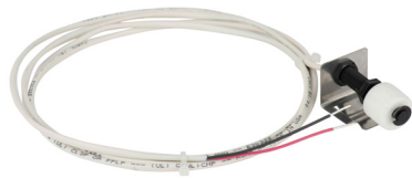
Condensate Overflow Switch #SS3