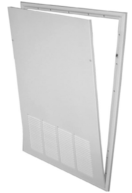
Optional wall panel Recessed wall application