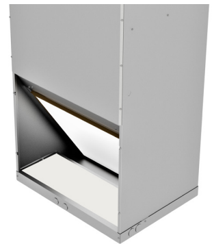
Condensate drain connections (With drain cover removed) (Male connections shown)