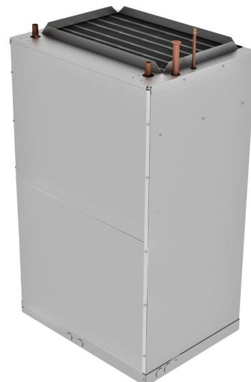
Unit shown with optional bottom return air kit