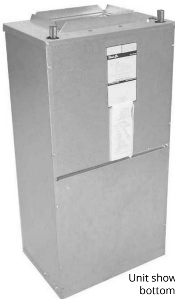
Unit shown with optional bottom return air kit