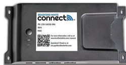
Optional Bradford White Connect™ Kit: Part No. 415-54067-00