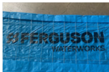
PRINTED SILT FENCE

For more information about Erosion and Sediment Control, contact Inside Sales at 800.448.3636 or info@ferguson.com or visit us at fergusongss.com