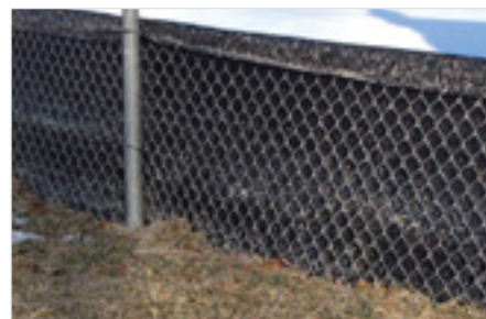
SUPER SILT FENCE POST