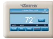
TSTAT0201CW (Sold Separately)

* For residential applications only. See Warranty certificate for complete details and restrictions, including warranty coverage for other applications.